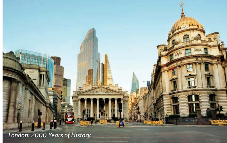
London: 2000 Years of History