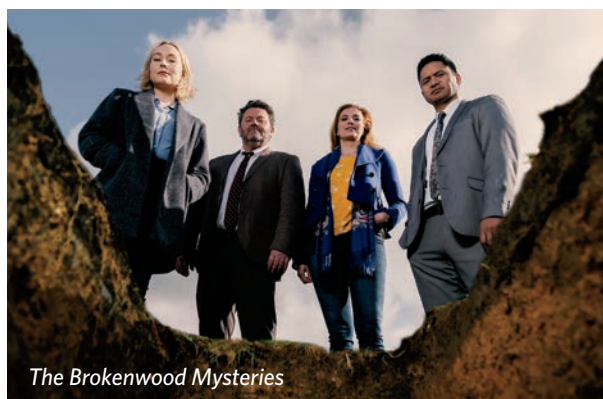
The Brokenwood Mysteries