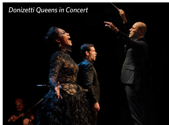
Donizetti Queens in Concert