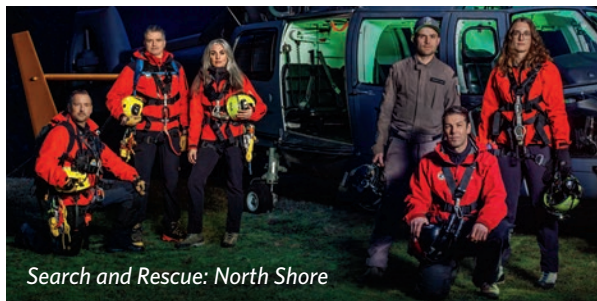
Search and Rescue: North Shore

This year, four projects were completed and had their broadcast premieres on Knowledge.