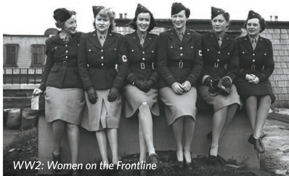
WW2: Women on the Frontline

WW2: Women on the Frontline – This popular series highlights stories of wartime peril, courage and heroism of women from across the globe. From fighter pilots and bombing squadrons to snipers, spies and resistance fighters, these are the untold stories of women who put themselves in the thick of danger for the greater good.