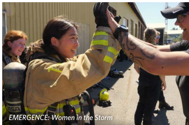
EMERGENCE: Women in the Storm