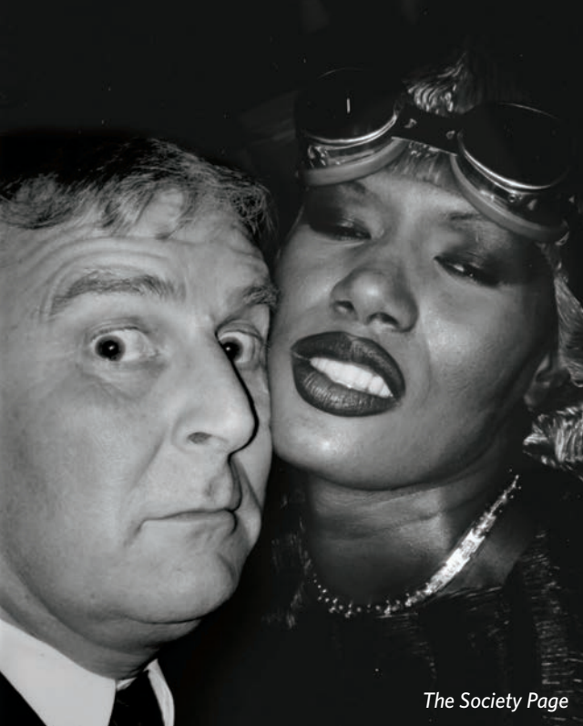
The Society Page