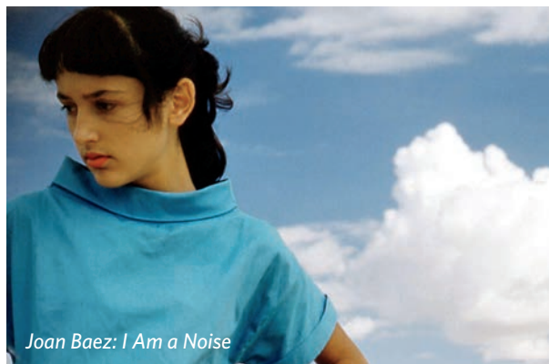
Joan Baez: I Am a Noise