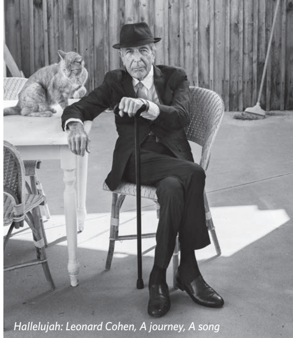
Hallelujah: Leonard Cohen, A journey, A song

Finally, Knowledge Partners love their twisty mysteries. We allocated $97K of Endowment income to returning drama favourites including The Brokenwood Mysteries , McDonald and Dodds and The Bay .